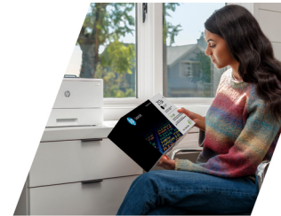
The Ideal Choice for Your HP Printer and Easy to Install

HP LaserJet 147X High Yield Black Original Toner Cartridge. Black toner page yield: 25200 pages, Printing colours: Black, Quantity per pack: 1 pc(s)