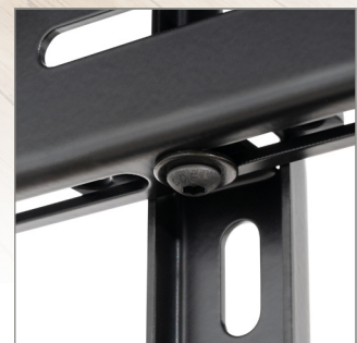
Safety locking screws help prevent unauthorised removal of screens