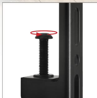
Levelling screws allow adjustment of screen height