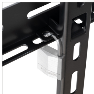
Padlock tabs on arms for additional security (padlock not included)