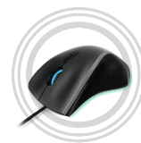
Lenovo Legion M500 RGB Gaming Mouse