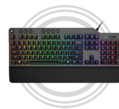
Legion K500 Gaming Keyboard