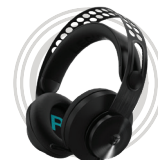
Lenovo Legion H300 Gaming Headset

* Example of Lenovo catalogue naming convention