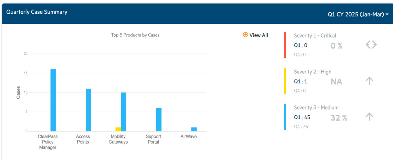
Figure 1. From the HPE Networking Support Portal landing page, select “Quarterly Case Metrics” to see an overview of your cases based on closed date, or you can click “View All” to see all cases.