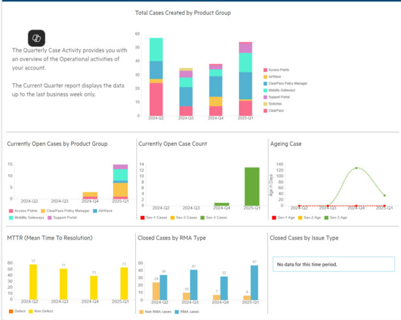
Figure 2. This screen shows historical case activity based on the case opened date. For example, Total Cases Created by Product Group shows the number of cases opened in the period by product.