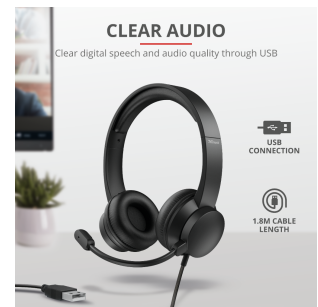
PRODUCT PICTORIAL 3