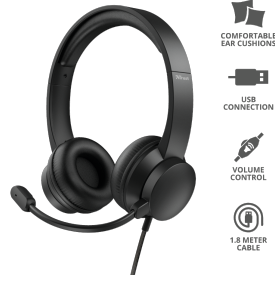
PRODUCT ESHOT 1