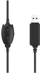
PRODUCT EXTRA 1