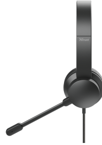
PRODUCT SIDE 2