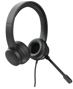
PRODUCT VISUAL 2