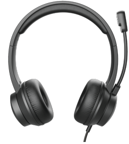
PRODUCT FRONT 1