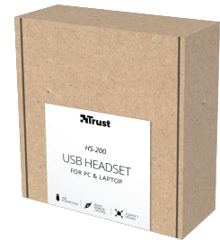
PACKAGE VISUAL 1