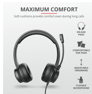
PRODUCT PICTORIAL 2