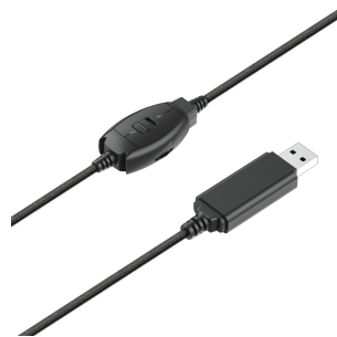
PRODUCT EXTRA 2