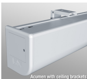
Acumen with ceiling brackets