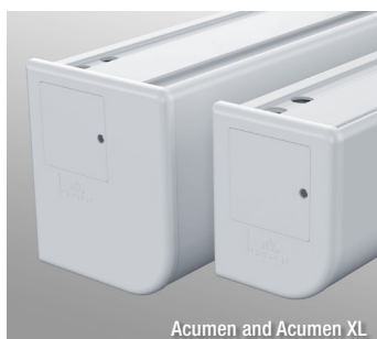
Acumen and Acumen XL