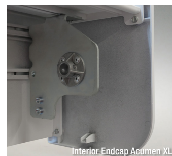
Interior Endcap Acumen XL