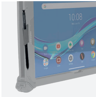
Stylus not included