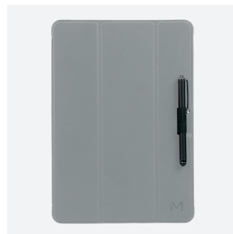
Stylus not included