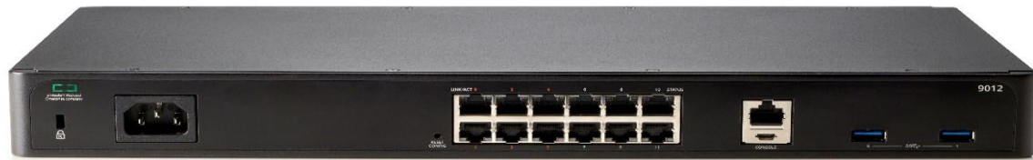
HPE Aruba Networking 9012 Branch Gateway