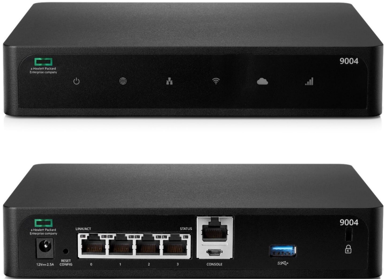
HPE Aruba Networking 9004 Branch Gateway

The HPE Aruba Networking 9000 series can be easily configured and managed using HPE Aruba Networking Central, a cloud-based network operations, assurance, and security platform. Onsite deployment is accomplished with a simple mobile installer application.