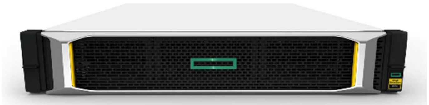
HPE MSA 1050 SAN Storage

NOTE:* US Street Price (MSA 1050 base unit, dual 1GbE iSCSI controllers, four 300GB HDDs); prices are subject to change without notice.