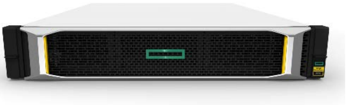
HPE MSA 2050 SAN Storage