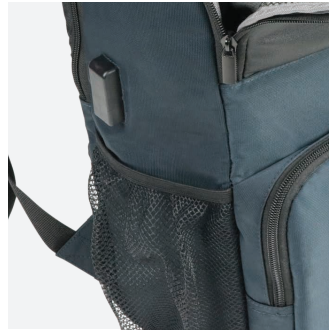
One Powerbank output