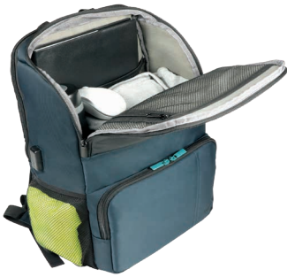
2 mesh pockets