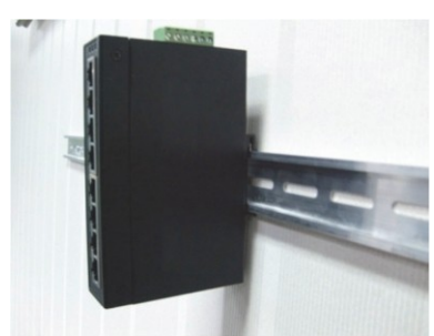
Step 2: Check the DIN-Rail is tightly on the track.

Install Industrial Equipment in DIN-Rail mount.