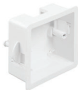
1 gang box