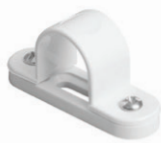
Spacer bar saddle