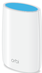
Orbi router (Model RBR50v2)