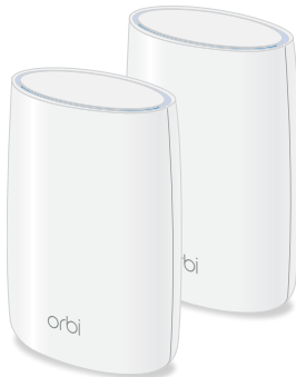
Orbi satellites (2) (Model RBS50v2)