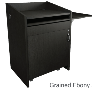
Grained Ebony Ash