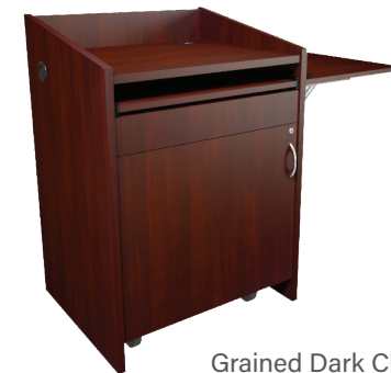
Grained Dark Cherry