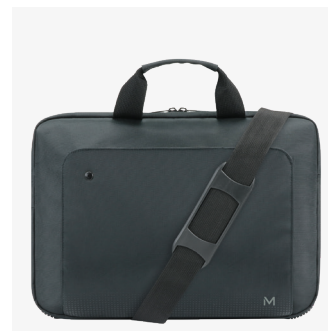
Adjustable and removable shoulder strap