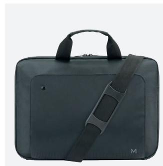
Adjustable and removable shoulder strap