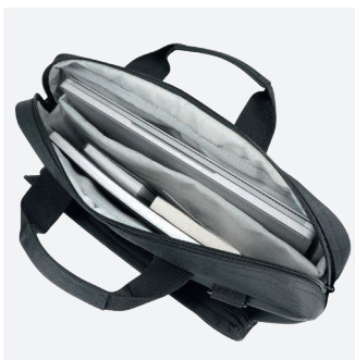
With reinforced pocket for laptop