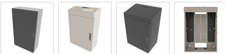
Full Door Split Door Plexi Top (provides top access and visibility to user) Split Door Solid top (provides top access to user) No Door