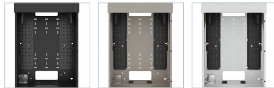
Black Putty White