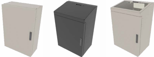
VWM-2-2-36K-PW VWM-SD-8-36K-BW VWM-PD-4-36K-PW