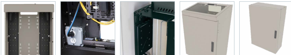
Putty or Black Color 2-Gang Electrical Box Fixed or Pivoting Rackrail Split Door with Solid or Plexiglass Hinged Top Cover or Solid Front Door