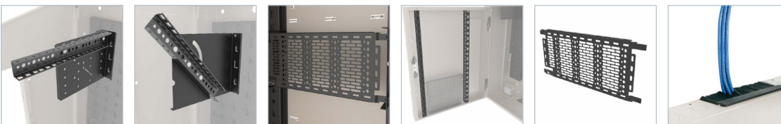
Fixed Rackrail Pivoting Rackrail Lever Lock™ Back Pan Kit Lever Lock™ Front Door Kits 17" Vertical Lever Lock™ Accessories Back Pan Brush Grommet