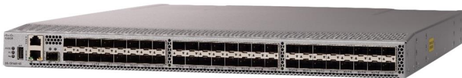
Figure 1. Cisco MDS 9148T 32-Gbps 48-Port Fibre Channel Switch