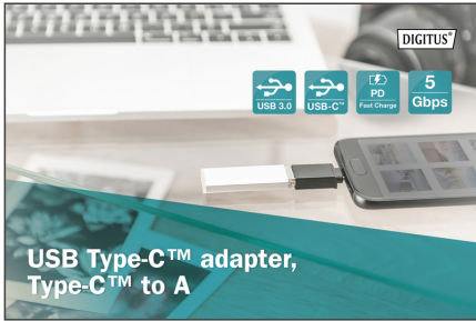
USB Type-C™ adapter, Type-C™ to A