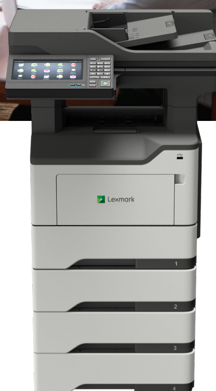
MX622adhe with optional trays