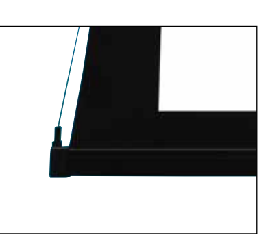
Slat bar retracts into the case