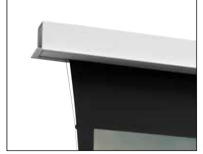
New case design for a clean finish