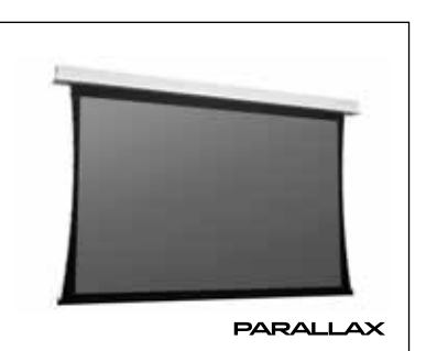
Now available with Parallax Ambient Light Rejecting option