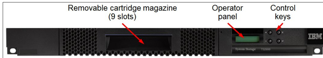
Figure 2. Front view of the TS2900 Tape Autoloader

The following figure shows the front of the TS2900 Tape Autoloader.