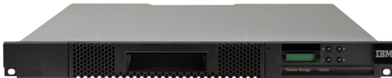
Figure 1. TS2900 Tape Autoloader

The TS2900 Tape Autoloader is shown in the following figure.