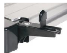
Rear clip and support brace