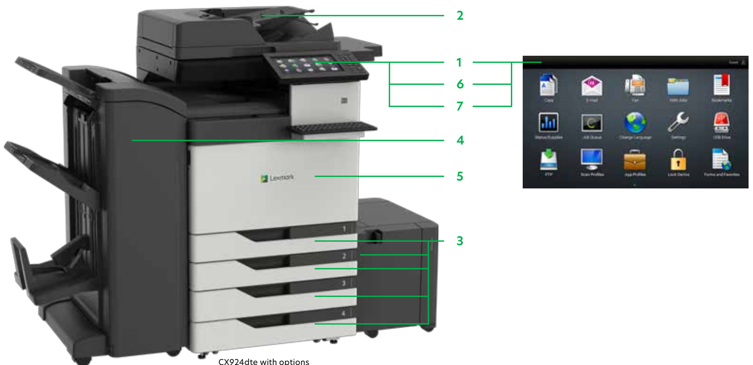
CX924dte with options

Print Microsoft Office files, PDFs and other document and image types from flash drives, or select and print documents from network servers or online drives.