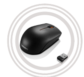
Lenovo 300 Wireless Mouse*