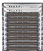
HPE FlexFabric 12908E Switch Chassis (JH255A)