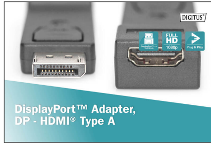
DisplayPort™ Adapter, DP - HDMI® Type A