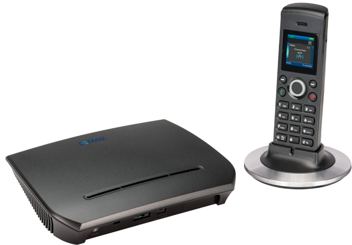
Mitel RFP 12 IP Single Base Station