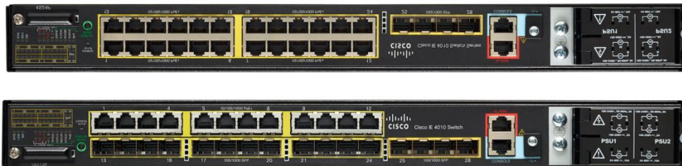
Table 2. Cisco IE 4010 Series Switches Models