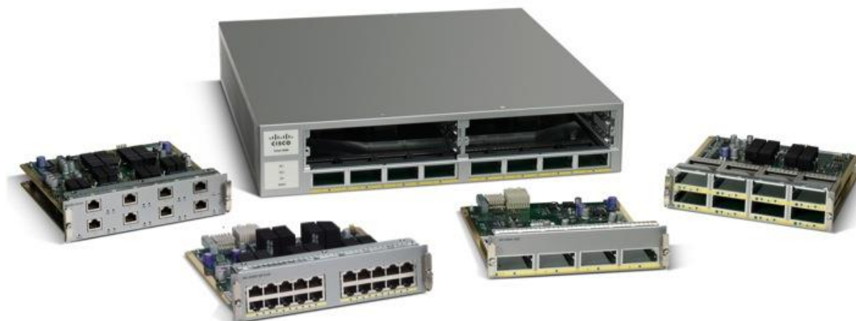
Figure 1. Cisco Catalyst 4900M Switch

The Cisco Catalyst 4900M configuration provides wire-speed connection, buffers to handle bursty traffic, and a comprehensive set of Layer 3 features required at the collapsed core and aggregation layer of the network. The Cisco Catalyst 4900M also supports a suite of ease-of-management features to simplify operations.