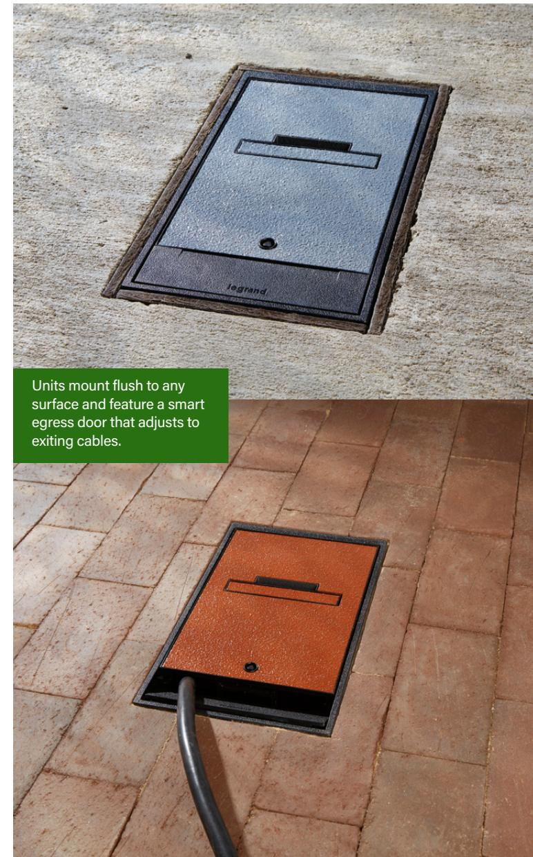
Units mount flush to any surface and feature a smart egress door that adjusts to exiting cables.