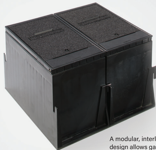
A modular, interlocking design allows ganging for specific connectivity needs.