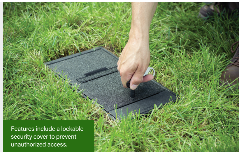
Features include a lockable security cover to prevent unauthorized access.