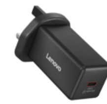
Lenovo 65W Mini USB-C GaN Charger