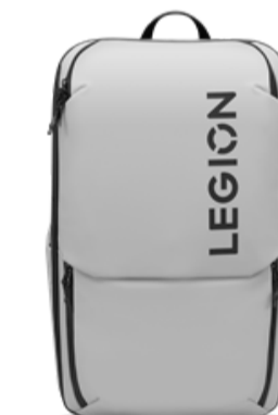
Lenovo Legion 17" Gaming Backpack GB800 (Light Gray)