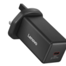
Lenovo 65W Mini USB-C GaN Charger