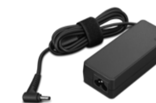
Lenovo 65W AC Adapter (Round Tip)-UK/Hong Kong/Malta/Mynamar/Singa...