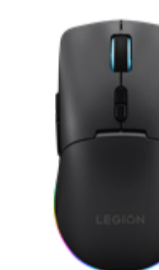
Lenovo Legion M220 Wireless RGB Gaming Mouse (Eclipse Black)