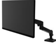
LX Pro Desk Arm