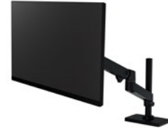
LX Pro Desk Arm, Tall Pole