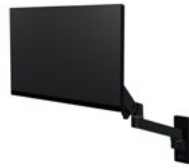
LX Pro Wall Monitor Arm