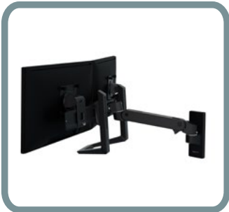
DUAL DIRECT KIT