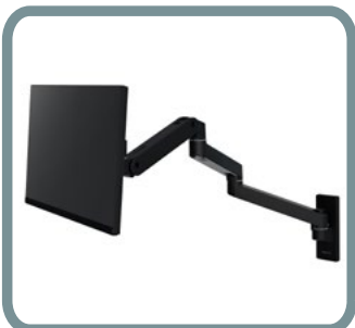
MONITOR ARM EXTENSION