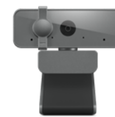
Lenovo Select FHD Webcam Gen2