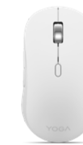
Lenovo Yoga Bluetooth Silent Mouse (Seashell)