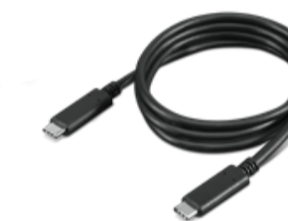
Lenovo USB-C Cable 1m