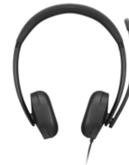
Lenovo Wired VoIP Headset 5000 (Teams)