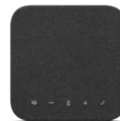
Lenovo Wireless Speakerphone 6000