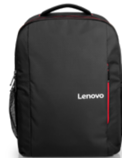
Lenovo 16" Laptop Everyday Backpack B510