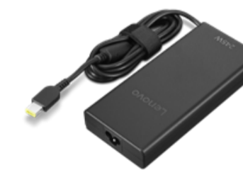
Lenovo 245W AC Adapter (Slim tip)-UK