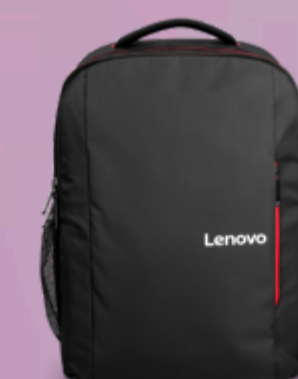
Lenovo 16" Laptop Everyday Backpack B510 4X41U80414

Please click here to view the full list of accessories.