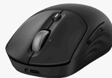
HP 700 Rechargeable Wireless Mouse A27B0AA