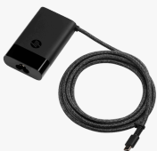
HP USB-C 65W Laptop Charger 671R2AA