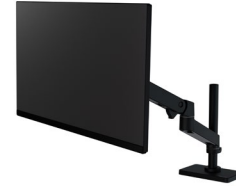
LX Pro Desk Arm, Tall Pole