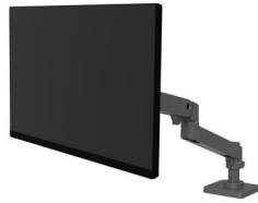
LX Pro Desk Arm