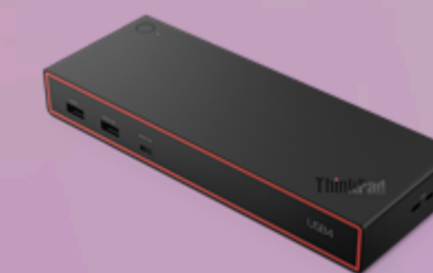
ThinkPad USB4 Dock 5000 40BF0100UK

Please click here to view the full list of accessories.