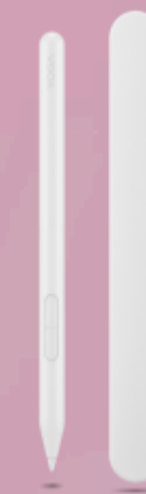
Lenovo Yoga Pen 2 with Pen Case - Seashell GXH1V16478