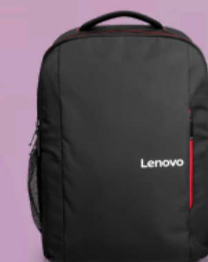
Lenovo 16" Laptop Everyday Backpack B510 4X41U80414

Please click here to view the full list of accessories.