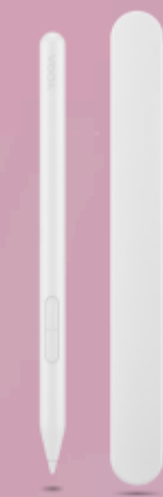
Lenovo Yoga Pen 2 with Pen Case - Seashell GXH1V16478