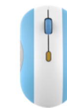
Lenovo 350 Bluetooth Silent Mouse (Fan Edition - Argentina)