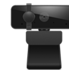
Lenovo 310 FHD Webcam Black