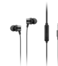
Lenovo Analog In-Ear Headphones Gen II Bulk Package (20pcs)