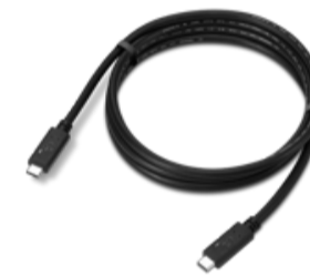
Lenovo USB 20Gbps USB-C to USB-C Cable 1.5m