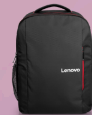
Lenovo 16" Laptop Everyday Backpack B510 4X41U80414