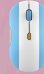
Lenovo 350 Bluetooth Silent Mouse (Fan Edition - Argentina) GY51U71763