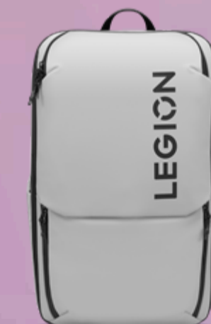
Lenovo Legion 17" Gaming Backpack GB800 (Light Gray) GX41U39300

Please click here to view the full list of accessories.